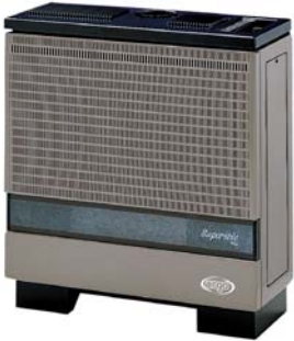
246 Dimensions: 760x720x250mm