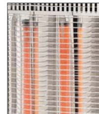
carbon fiber heating elements