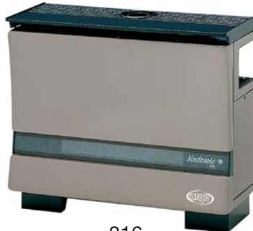
316 Dimensions: 695x830x270mm