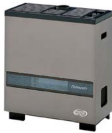
1.62 Dimensions: 580x440x240mm