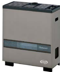
2.78 Dimensions: 645x600x240mm