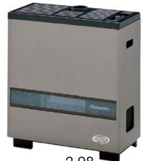
2.98 Dimensions: 710x660x240mm